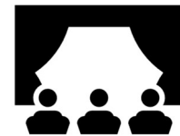
Arts & culture

Map your findings and ideas for your neighborhood on the back of this sheet!