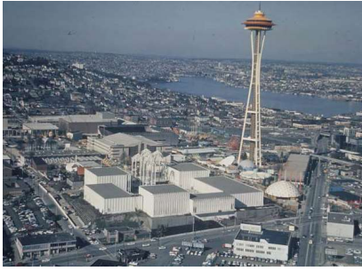
Aerial view of Space Needle looking north, 1962.