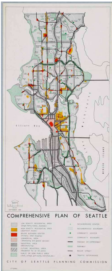
Comprehensive Plan of Seattle, 1956.

Watch the video introduction on the MOHAI YouTube channel (@mohaiprograms) to learn about the history of Seattle city planning and see the bingo activity in action!